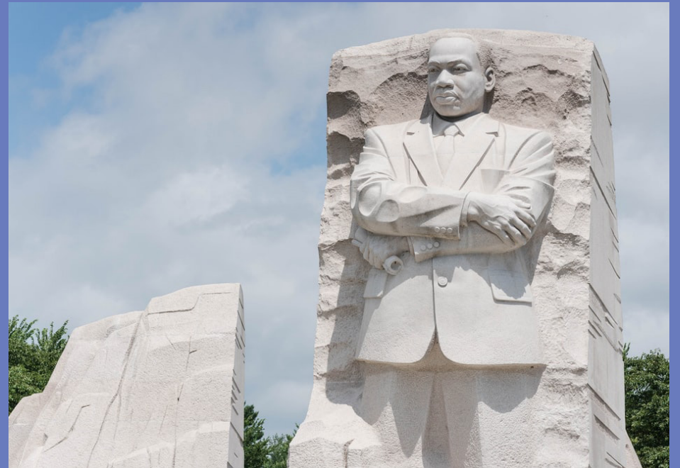
International African American Museum