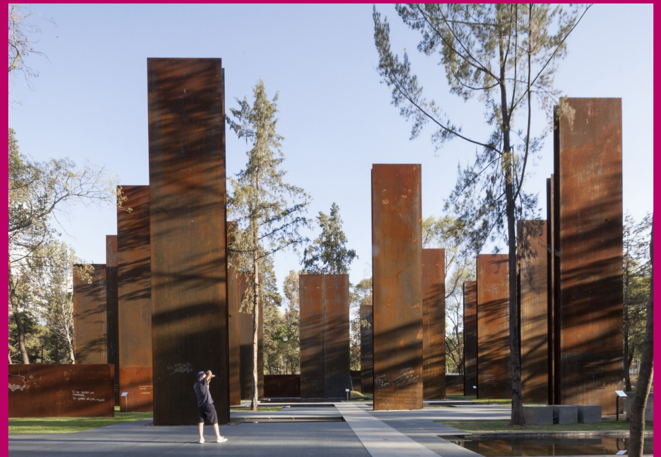
Memorial to Victims of Violence in Mexico