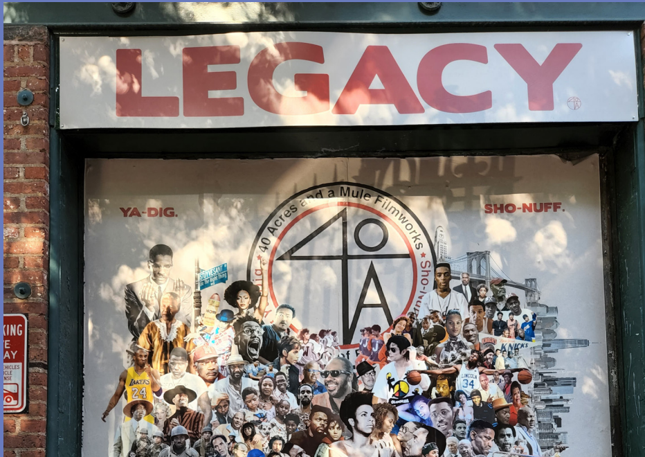
Spike Lee's Mural