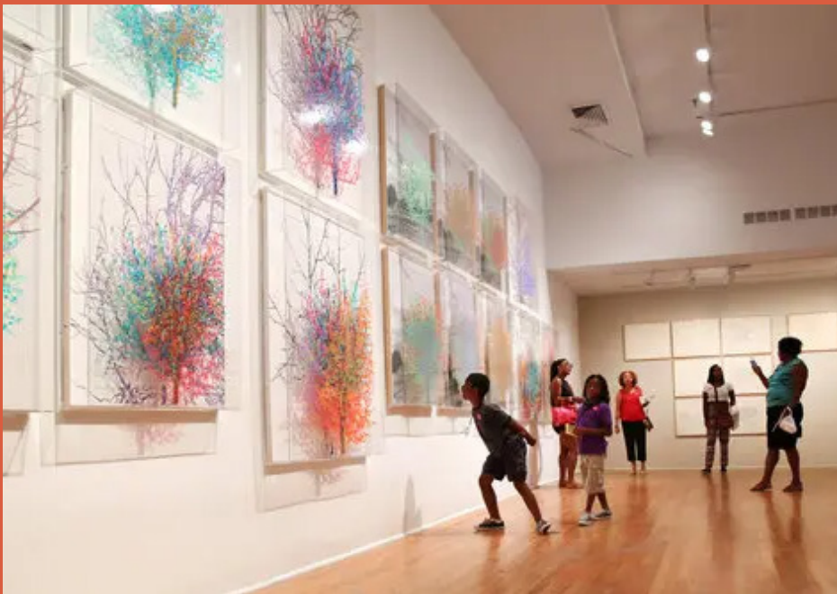
Studio Museum in Harlem