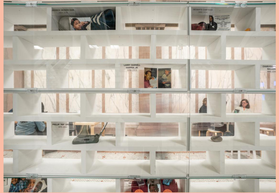
Immersive Sensory Exhibit