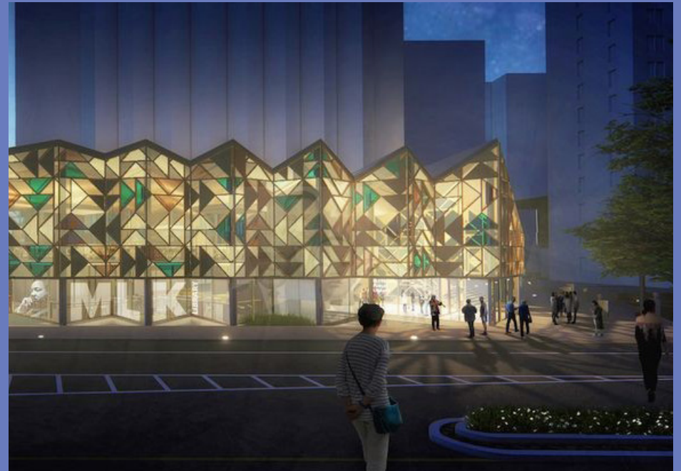
Cleveland Public Library - MASS