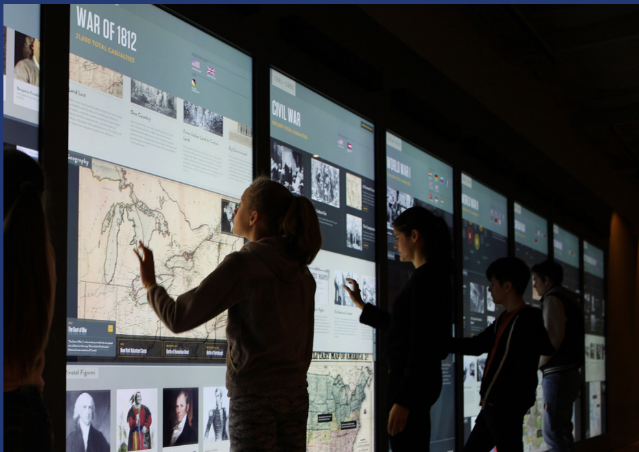
Interactive Touch Screen Timeline