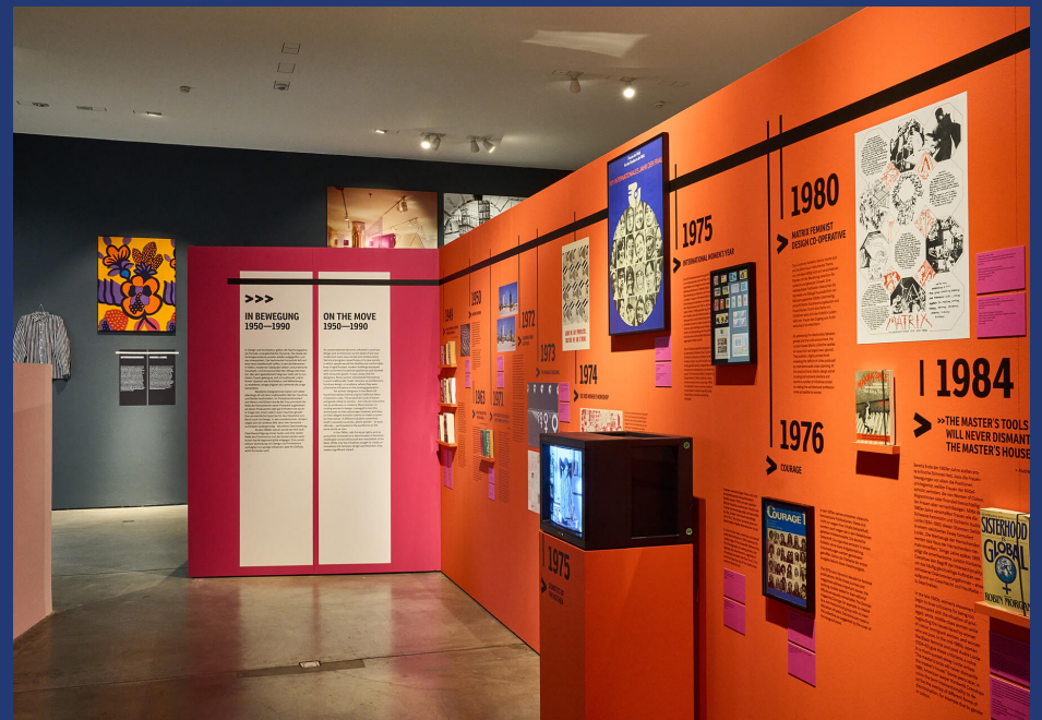
Mixed Media Timeline