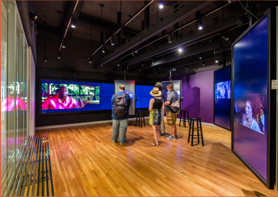
Schomburg Center for Research in Black Culture