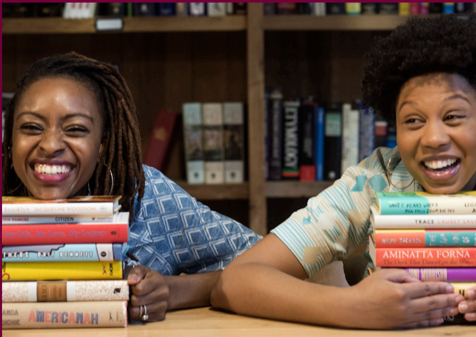
Larger Collection for Black books + Authors