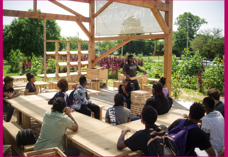
SweetWater Foundation Classroom