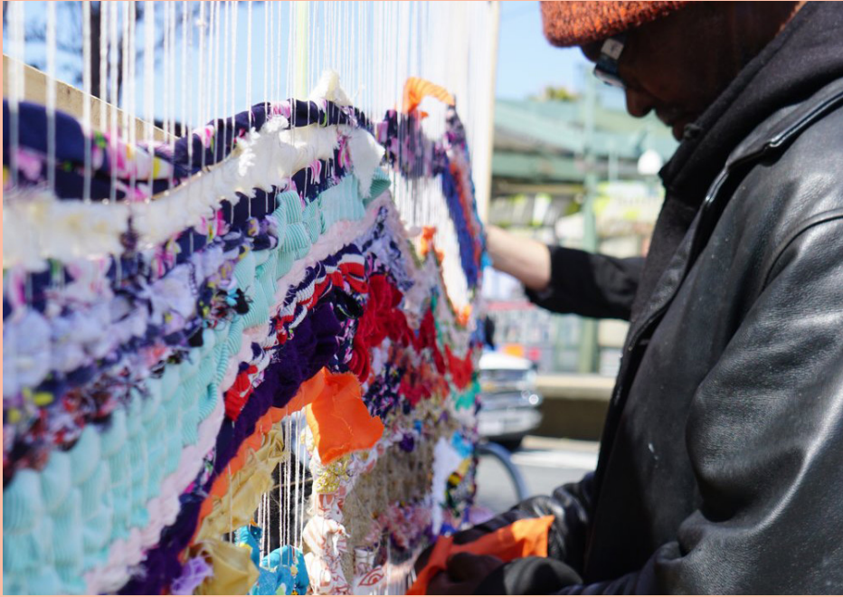
Community Weaving Project