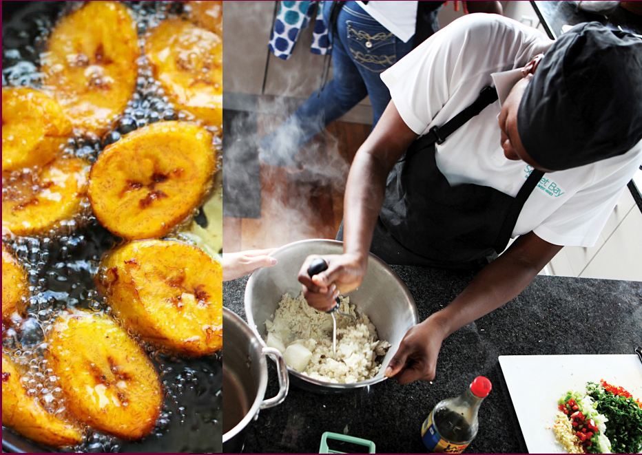
Cooking Demonstrations and Classes