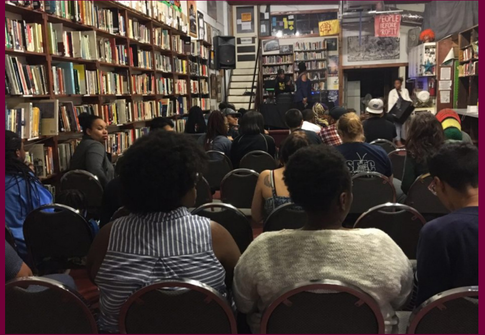
Community Meetings, Lectures, and Discussions